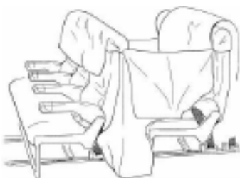
Fig1: example of installed CSB ready to be loaded